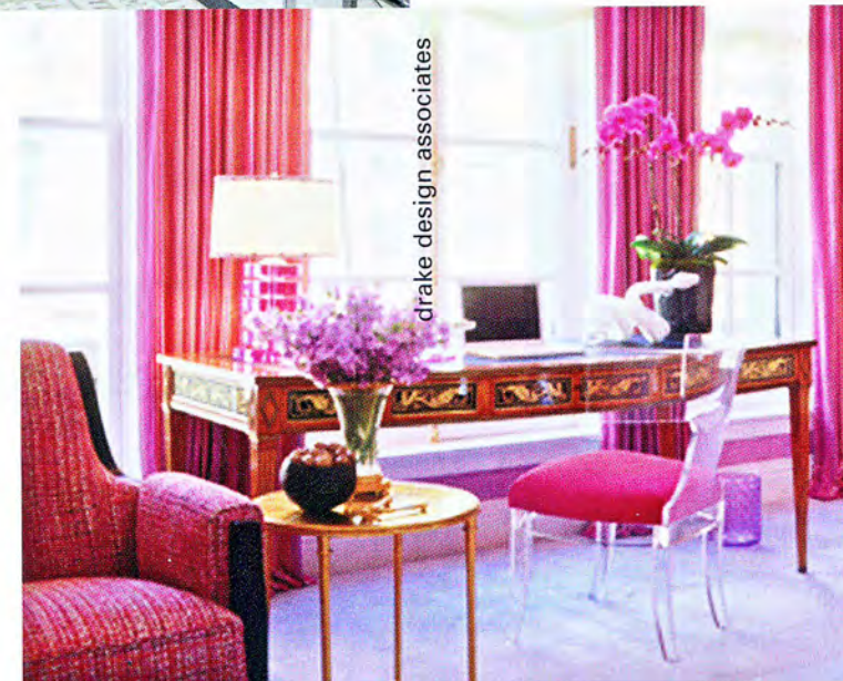
drake design associates

TRADEMARK / Progressive, environmentally sensitive architecture