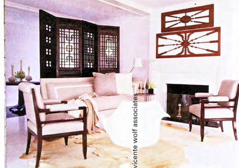
vicente wolf associates