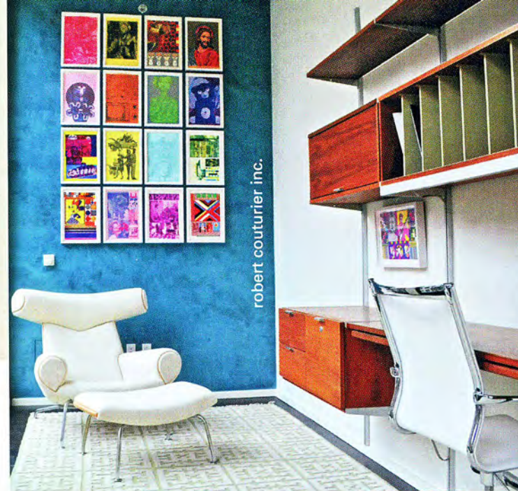
robert couturier inc.