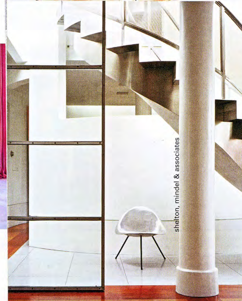
shelton, mindel & associates