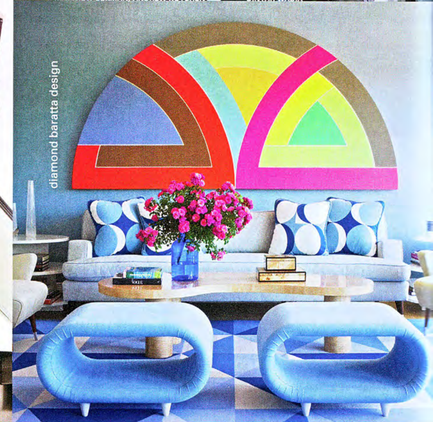
diamond baratta design